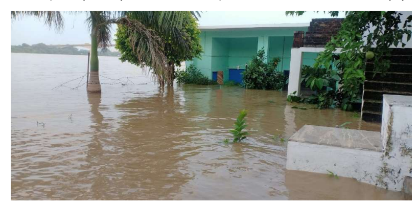
You can still see the tops of the blue doors of my house. This photo was taken on Saturday; the water has risen since then.

Just a couple of days after I sent the last email, the waters of the Ganges River started rising dramatically. Since my house is lower than most, I called a few of our older students to help, and we moved most of everything out of my house last Saturday. On Thursday, when the river actually entered my house, I moved the bits that I had left inside (on top of my kitchen counter). Now the whole house is empty, and I'm staying in