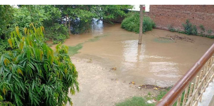
Taken Saturday afternoon. The water has since completely covered the ground.

The bigger problem is for our community. Several of our students (like me) have already had to shift all their possessions to higher ground. By and large, they have alternate places to stay. But if the water continues to rise, many more will be displaced. Daily routines like bathing and cooking are more difficult. Obtaining clean water during